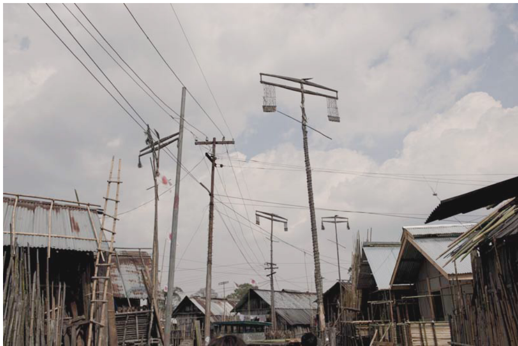
Figure 5: Hang village (Fulvio Biancifiori, 2013)