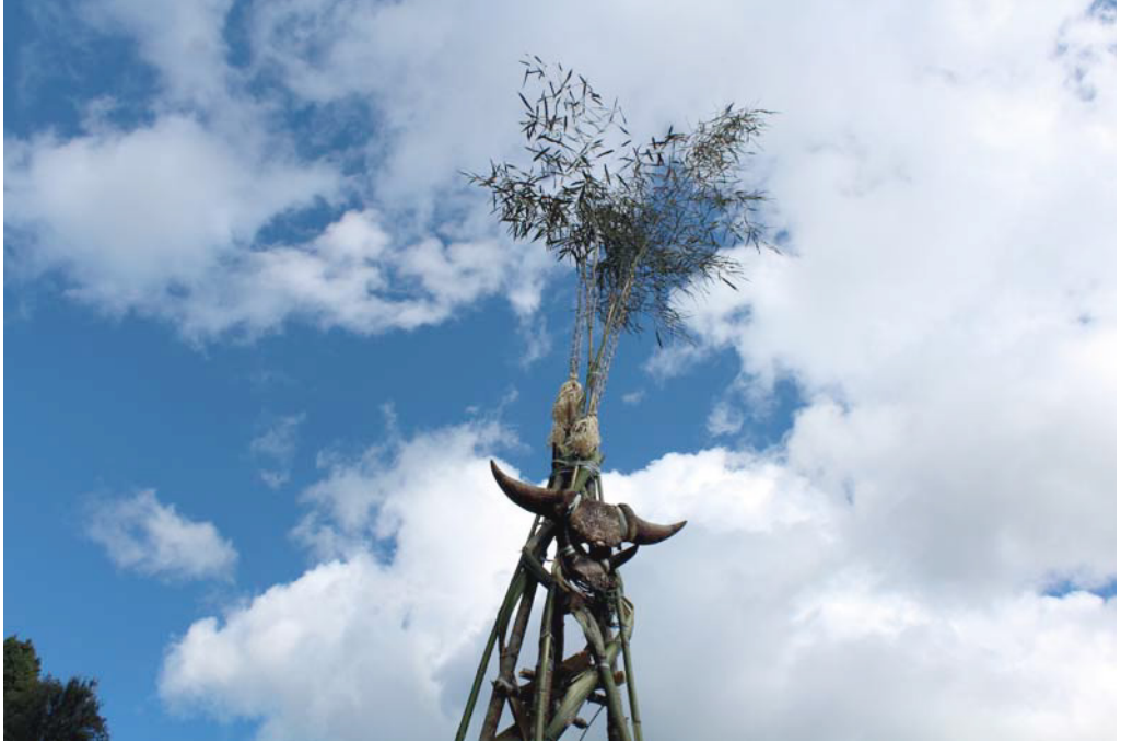
Figure 7: Apatani tomb, Hang