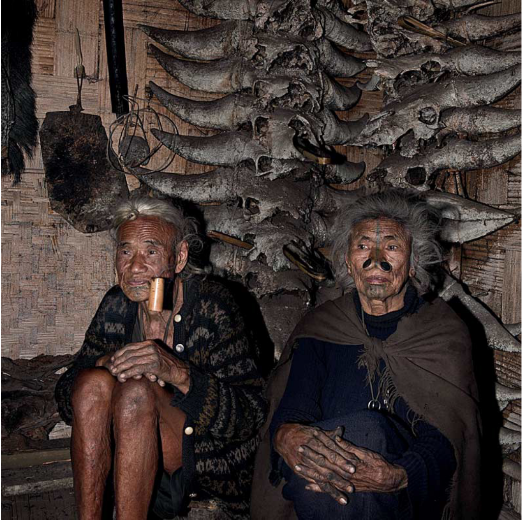
Figure 2: Apatani house, Hang

These populations still maintain their own language, articulated through different local dialects, yet all originally of Tibetan-Burman stock; the idea, therefore, of a hypothetical origin from the north, through ancient migrations, is therefore plausible, even if not immediately evident. Moreover, the shamans of the tribes, the nyibus in the Apatani language, 4 are the custodians of a secret knowledge that is called miji migung : literally “singing” and “prose”, two genres that through the (also sung) narrative constitute the epic cycle of the history of the tribe, handed down orally from generation to generation. It is interesting in this regard to note that to define shamanic power, the Apatani