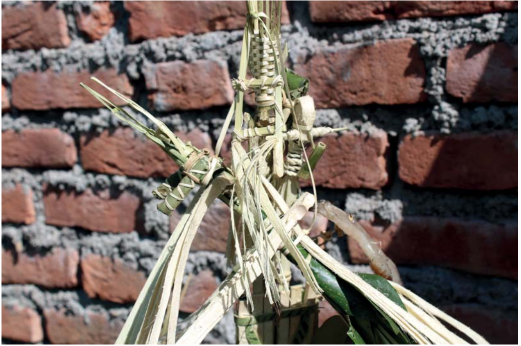
Figure 3: A buru , an apotropaic woven-straw fetish, Ziro Valley (Federico Ceratto and Linda Gerbaudo, 2018)

each other almost like an army of silent sentinels, they rise just outside the villages, preserving the area from malign external influences.