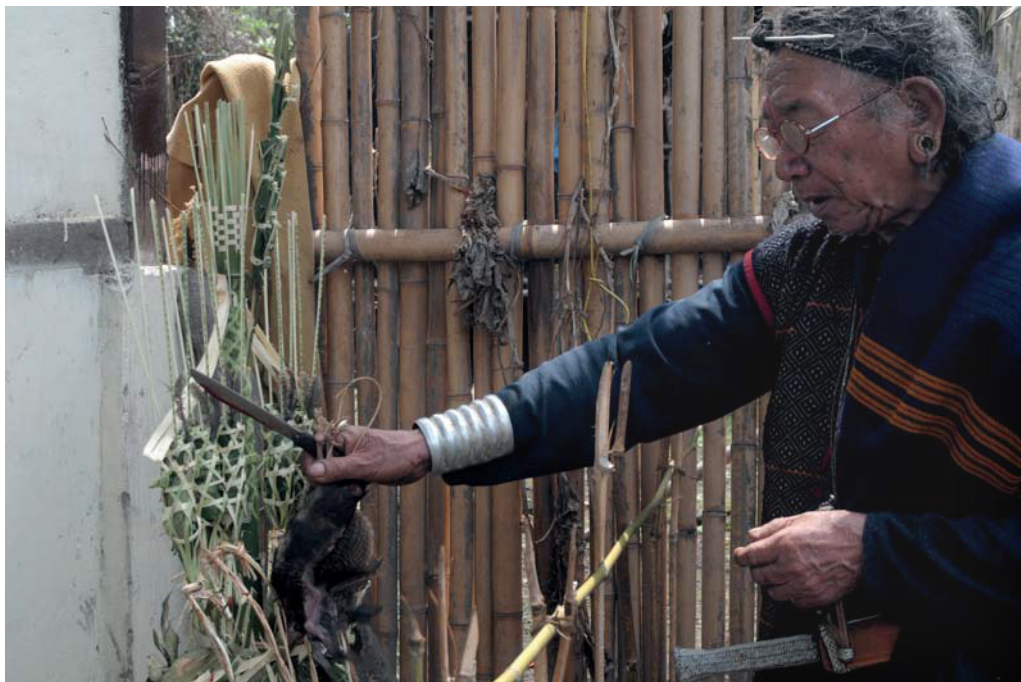
Figure 6: A nyibu while performing a rite with sacrifice, Hang (Claudio Mattolin, 2017)