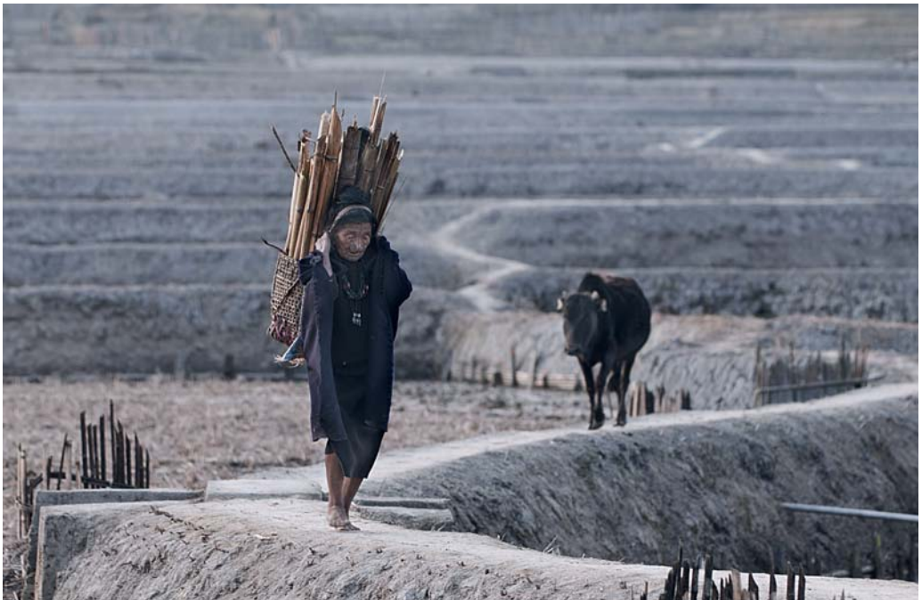
Figure 1: Apatani woman, Ziro valley

According to the sources in the field, 3 the legends and cosmogonic myths that the Apatani have handed down from generation to generation tell of an ancient ancestor, Abo Tani, who gave rise to three lineages that followed different directions, migrating from the northwest or from Tibet and subsequently settling in India. One of the most interesting aspects of this myth is that it is shared by related indigenous groups in the region, the so-called Tani groups – the Nishi, the Mikir, the Hill Miri, the Adi, the Sulung and the Tagin. These groups thus share a sort of meta-narrative about the time of their origins, feeling related to each other and united by an ancestral bond to the territory in which they live.